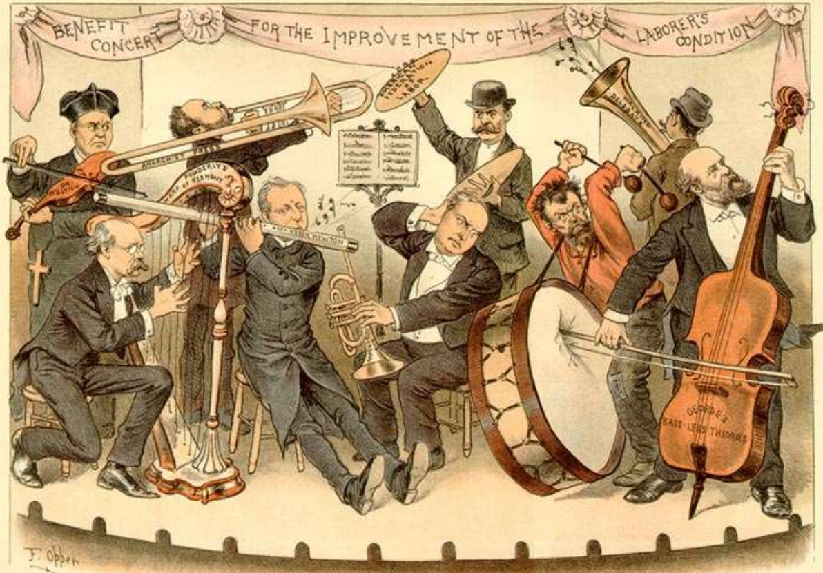
WANTED, A LEADER! - THE LABOR-AGITATION ORCHESTRA ON THE GO-AS-YOU-PLEASE PLAN.